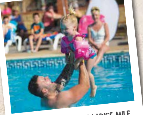
GREAT FAMILY FUN AT LADY'S MILE

WHY NOT DOWNLOAD THE LADY'S MILE APP TO RECEIVE ADDITIONAL OFFERS FOR YOUR STAY.