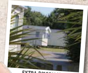
EXTRA DISCOUNTS DURING YOUR STAY!

WHY NOT DOWNLOAD THE LADY'S MILE APP TO RECEIVE ADDITIONAL OFFERS FOR YOUR STAY.