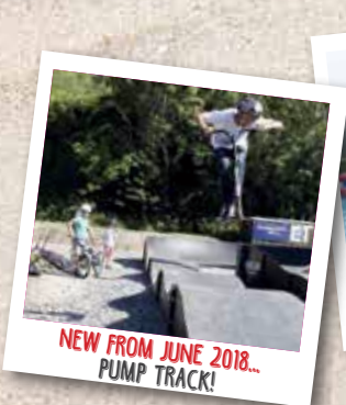
NEW FROM JUNE 2018... PUMP TRACK!