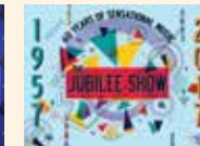
THE JUBILEE SHOW