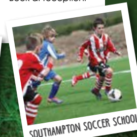
SOUTHAMPTON SOCCER SCHOOL