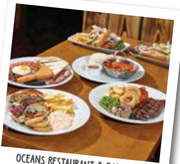
OCEANS RESTAURANT & BAR MENU OFFERS A WIDE RANGE OF CHOICE