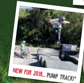
NEW FOR 2018... PUMP TRACK!*