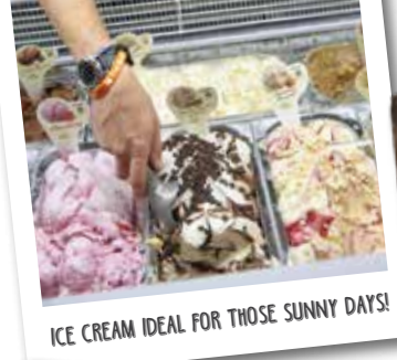
ICE CREAM IDEAL FOR THOSE SUNNY DAYS!

Friday, Saturday & Monday mornings from 9.30am-10.15am.