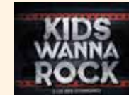
KIDS WANNA ROCK