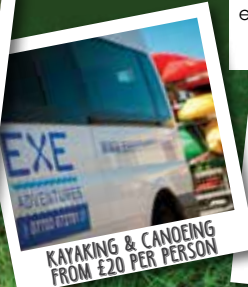
KAYAKING & CANOEING FROM £20 PER PERSON