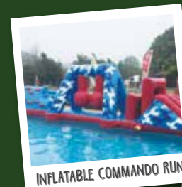
INFLATABLE COMMANDO RUN

PLUS!... This year we have teamed up with River EXE Adventures, specialists in kayak and canoeing experiences... This will be a great holiday, you'll never forget!!!